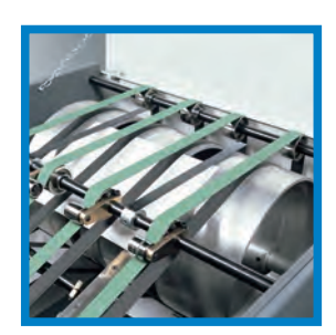
Sequence keeping device.